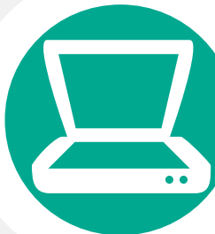
Epson Perfection V500