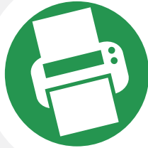
Epson Stylus NX400, CX8400, CX9400Fax, Epson Stylus Photo RX680, R1900 or R2880

Purchase an Epson Stylus ® NX400, CX8400, CX9400Fax, Epson Stylus Photo RX680, R1900 or R2880 , together with any Apple ® computer or notebook, from an authorized Apple Specialist, and get the following back by mail: