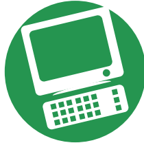
Any Apple computer or notebook