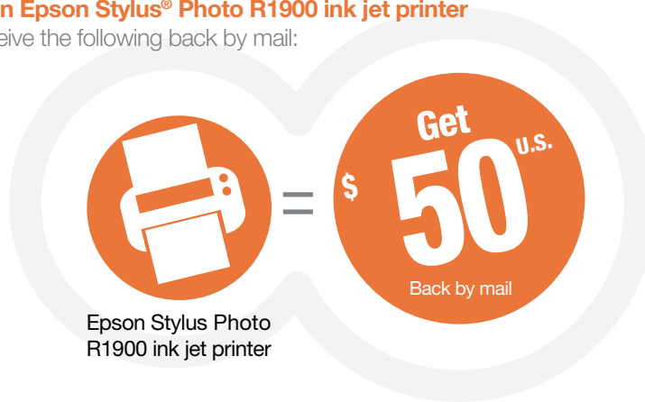
Epson Stylus Photo R1900 ink jet printer

Buy an Epson Stylus® Photo R1900 ink jet printer and receive the following back by mail: