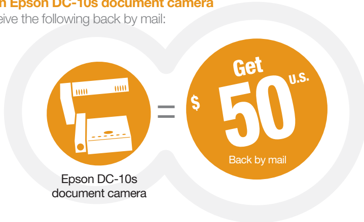
Epson DC-10s document camera

PRODUCT MUST BE PURCHASED BETWEEN 9/1/08 AND 11/30/08.