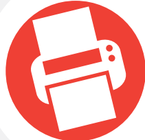
Epson Stylus NX300, NX400, WorkForce 500, WorkForce 600, Artisan 700 or Artisan 800

Purchase an Epson Stylus ® NX300, NX400, WorkForce ™ 500, WorkForce 600, Artisan ™ 700 or Artisan 800 , together with any digital camera or personal computer or notebook (including Apple ® ), from an authorized Apple Specialist or Apple reseller and get the following back by mail: