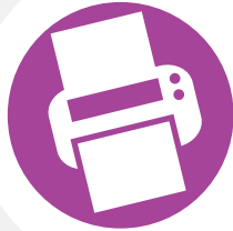
Epson Stylus C120

Purchase an Epson Stylus ® C120 , together with a digital camera or personal computer or notebook (including Apple ® ) from an authorized Apple Specialist or Apple reseller and get the following back by mail: